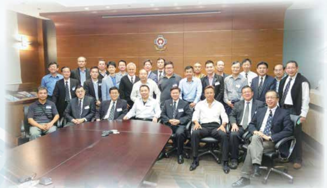
Guided tour to Wong Ming Him Hall

It has been 40 years since our graduation in 1975, a big gathering event was held on 28 th November, 2015 at the School Hall for the Form 5 (1975) and Form 7 (1977) graduates. It started with a happy hour singing by our own band 'The Young Ones', a guided tour around the school premises, photo-taking and a dinner buffet packed with happy and memorable performances and programs; around 100 alumni and teachers attended and enjoyed the function very much.