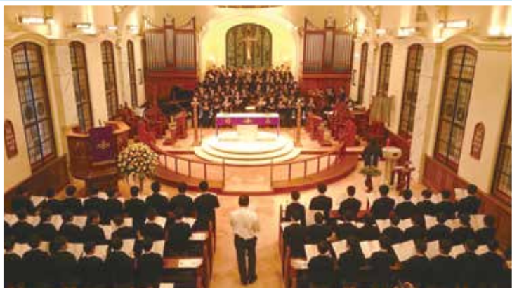
Carol Services with current students at St. Paul's Church (December 2015)