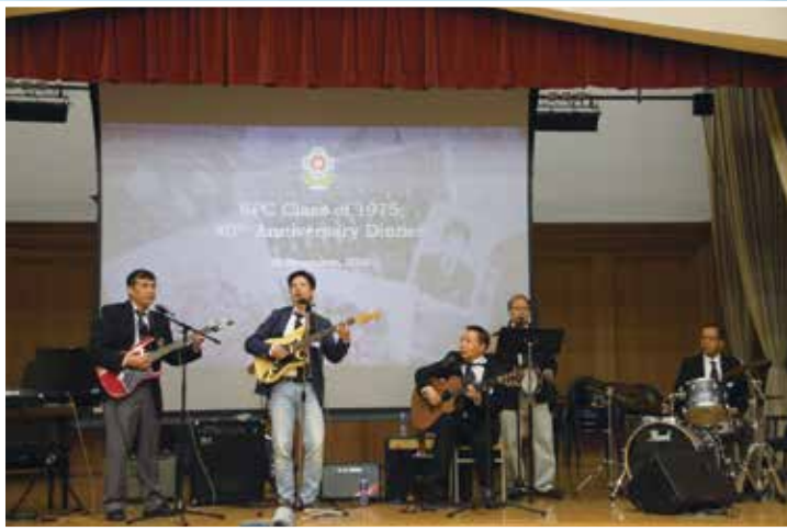
“The Young Ones” Band