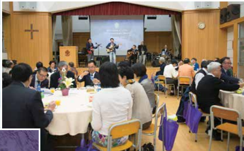
Enjoyable dinner and programs