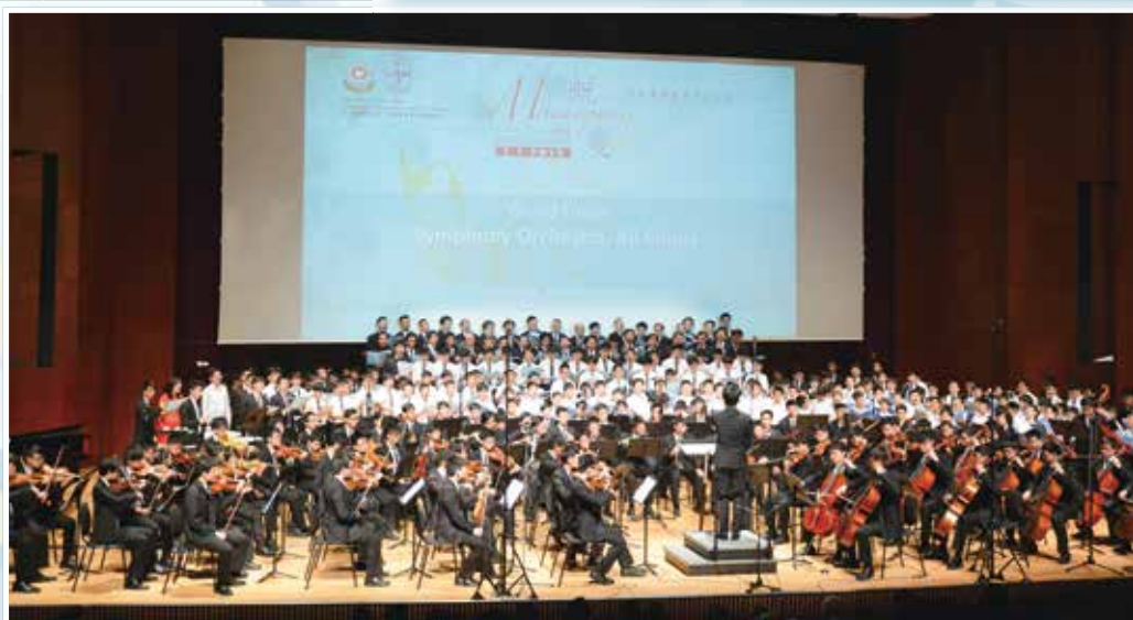
St. Paul's College Summer Concert 'Metamorphosis' (July 2015)