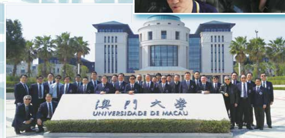
'From Baroque to Pop' concert by Choi Kai Yau College of the University of Macau (February 2016)