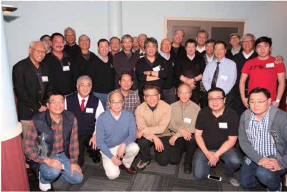
Group Photo

The Annual Chinese New Year Spring Dinner for the SPC Alumni (San Francisco Bay Area) was held on Saturday, March 5th, 2016 at China Village Seafood Restaurant in Belmont California. The event was a success with a record-high attendance of 28 alumni (Class of 65 to 2010) and their family members (44 total attendance).